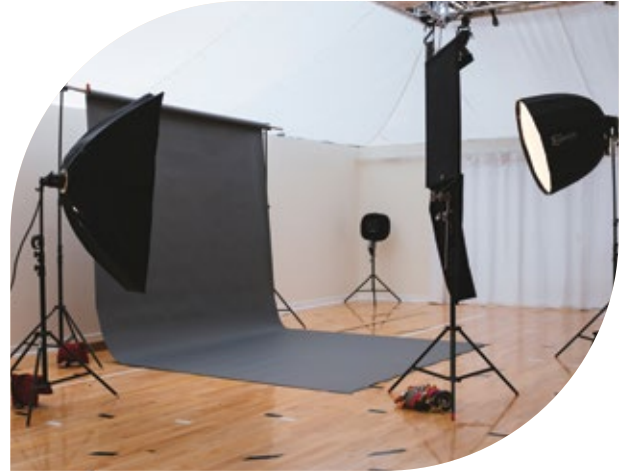
CASE STUDY 2 —

"an excellent example of local, thriving creative industries.an excellent example of local, thriving creative industries."